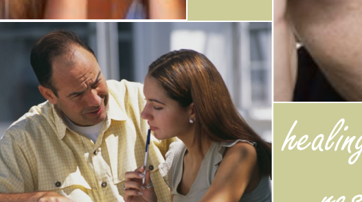
healing & restoring