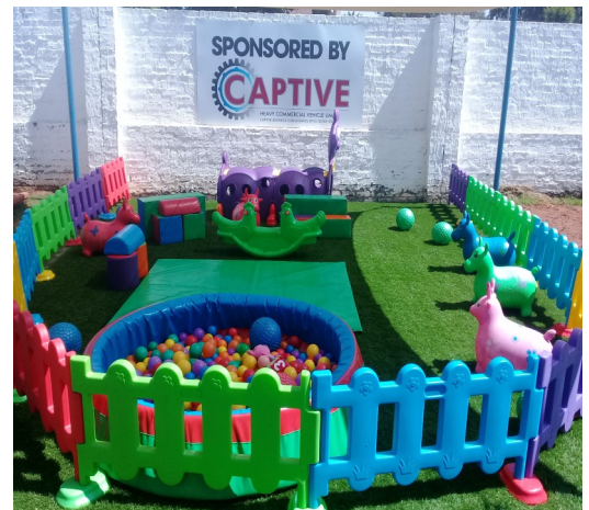
New Play area sponsored by Captive Business Consultants

We would like to call upon all who live and work in South Africa, to contribute to our invaluable cause, which is to love and care for unwanted and abandoned babies placed in our care by the courts. The goal is to have 100 people donate R250 per month towards this worthy cause.