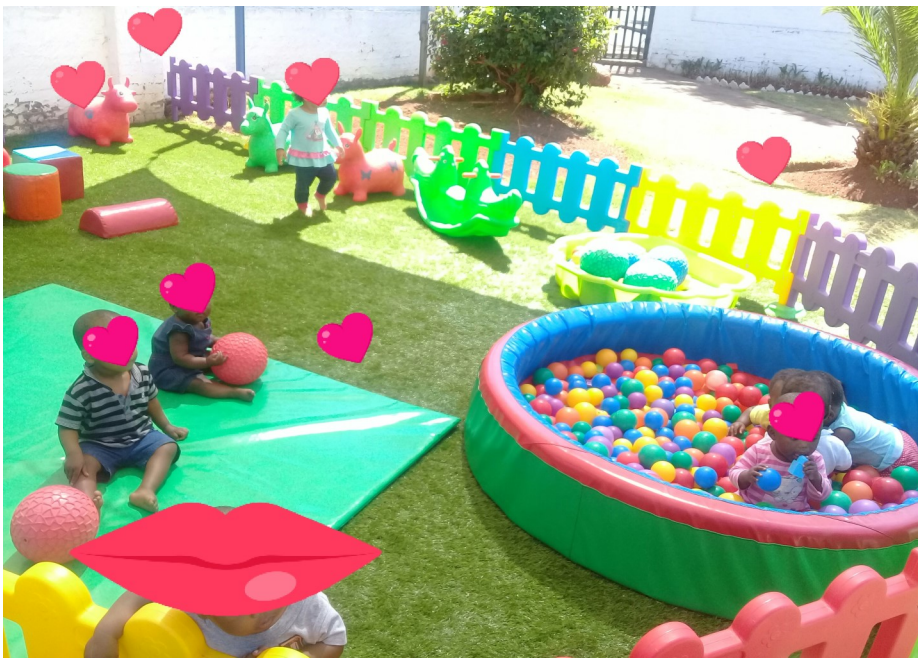
Play time at El-Shammah Home