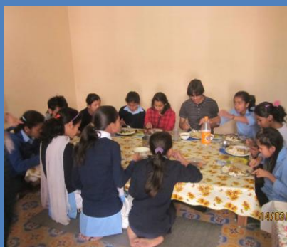
Basic food during final exam at hostel facility