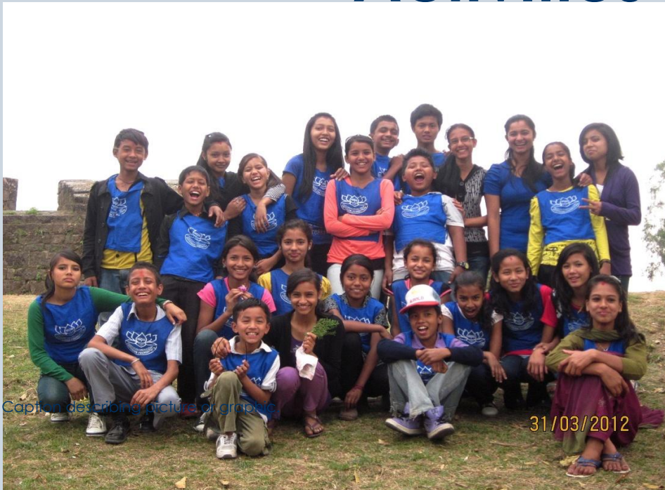
Caption describing picture of graphic

Visit to the fort of Sen dynasty that used to rule the present Makwanpur district