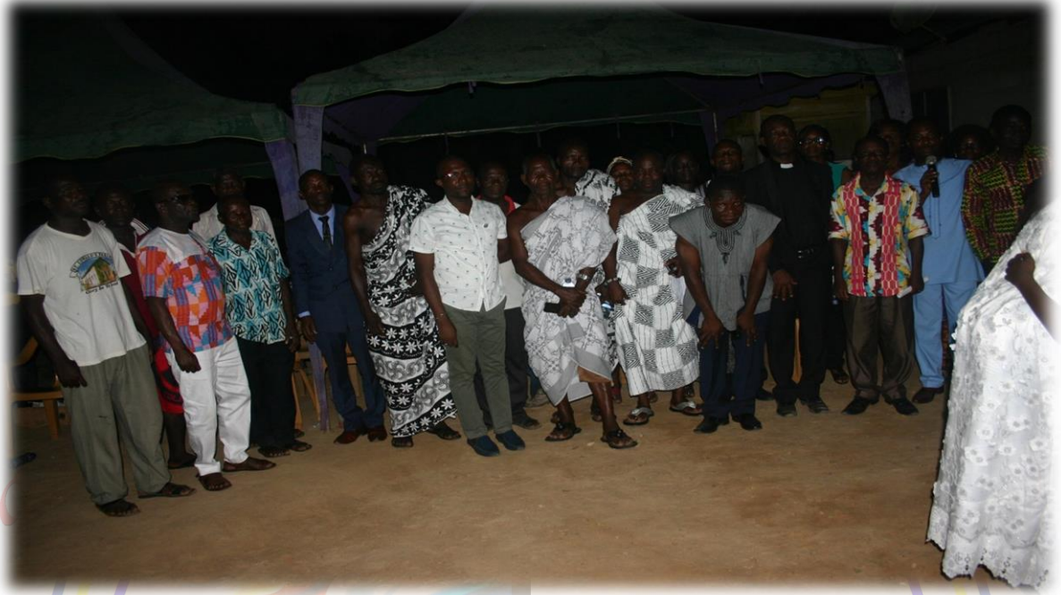
CCCN team and Elders of Abodo in a group picture after 16 th December, 2019 educate a child program.