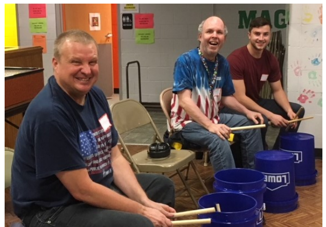
Tangram clients and staff participate in a drum circle.

As the date of the event approached, Indiana's unpredictable spring weather struck! March 24th brought ten inches of snow to Central Indiana and forced us to postpone the event.