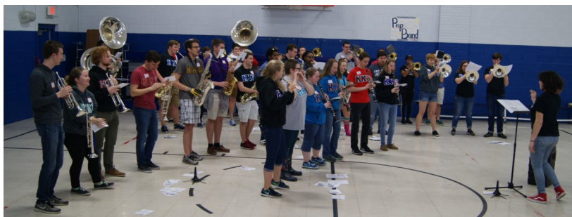
The pep band performs for the audience.

Knowing that opportunities to explore music are always popular among our clients, as evidenced by our long-running music club , Tangram jumped at the chance to work with the students on a music exploration event. The event was scheduled for March 24 and the students of Kappa Kappa Psi worked tirelessly to plan an event that would offer different