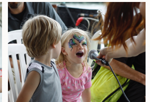
Children were invited to interact with the authors