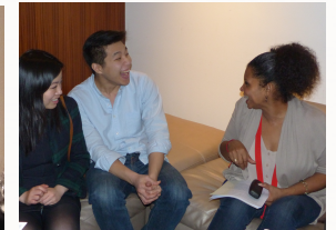
We strive to make it easy for writers who are parents to form/join communities