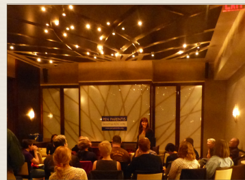
Literary Salons are free and open to the public, featuring top-tier authors.

We envision an arts world that embraces and values the hard work and dedication required to keep a creative writing career going while also raising a family. We do our part to ensure that the writing world values the creative efforts of parents and does not marginalize them.