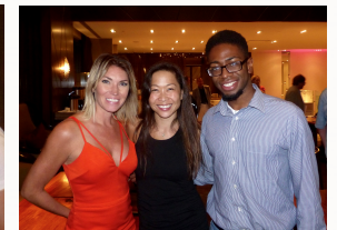
Salons bring neighborhood professionals together over love of words