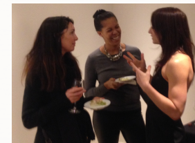
networking is important to the success of every writer