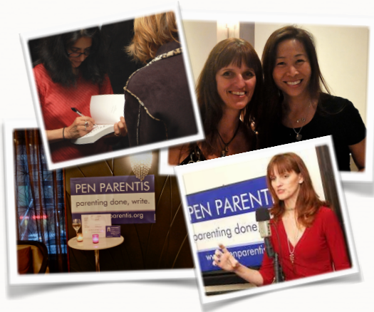
Pen Parentis Literary Salons have celebrated a diversity of writers who are also parents since 2009.