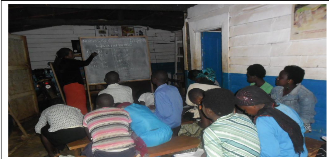
Young people in full literacy session in Walungu

The evaluation form was adapted to the specificities of each center and focused on learning to read, write, calculate and use the telephone and the calculator.