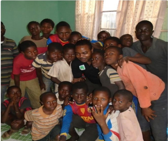
Photos of beneficiary children at the PIFEVA center in Bukavu