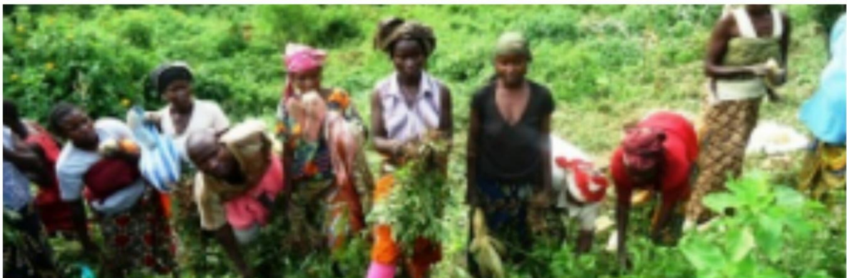
Photos of the fields of demonstration of agricultural activities