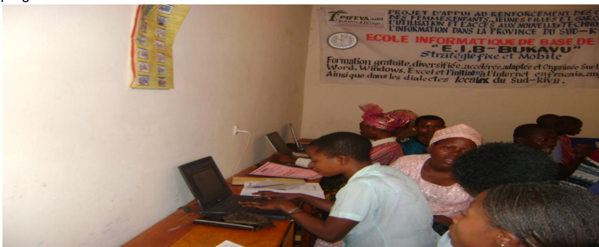
Photo of girls and women learning computer science in Bukavu

Creation of a "Basic Computer School" (EIB-BUKAVU), which trained 476 beneficiaries free of charge, including 401 women and girls and 75 boys on the Windows, Word and Excel programs in 2016-2017.