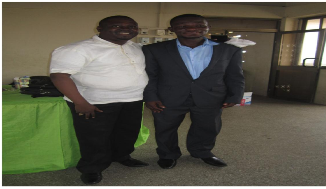
Hope and Opportunities in People.