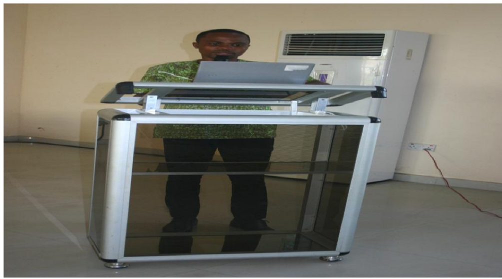
A Psychiatric team member of CCCN from Ankaful Mental Hospital doing a presentation on effects of Alcohol and Drug Abuse