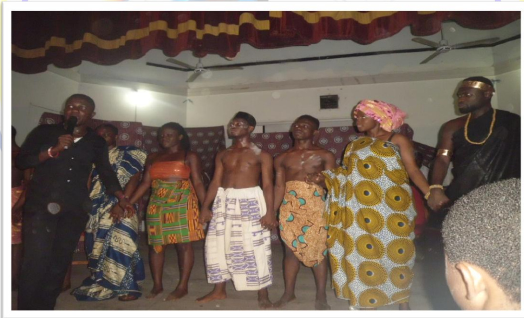
Creating Suitable Environment, Restoring Hope and Opportunities in People.