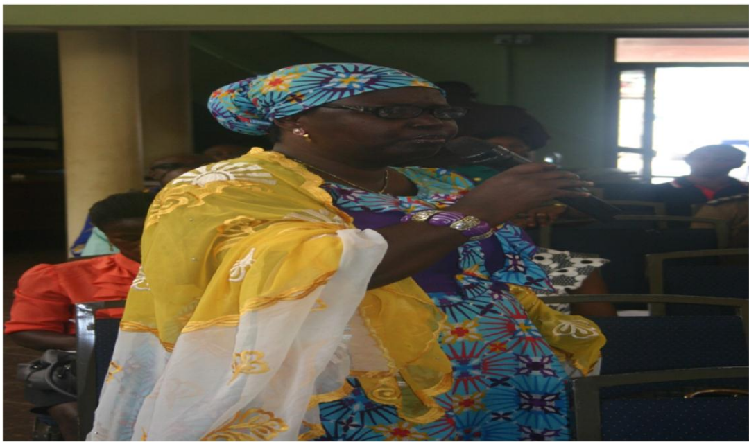
A representative of Muslim Women Association