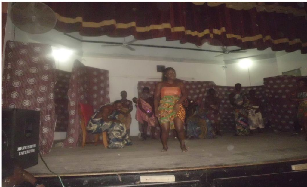
Hope and Opportunities in People.