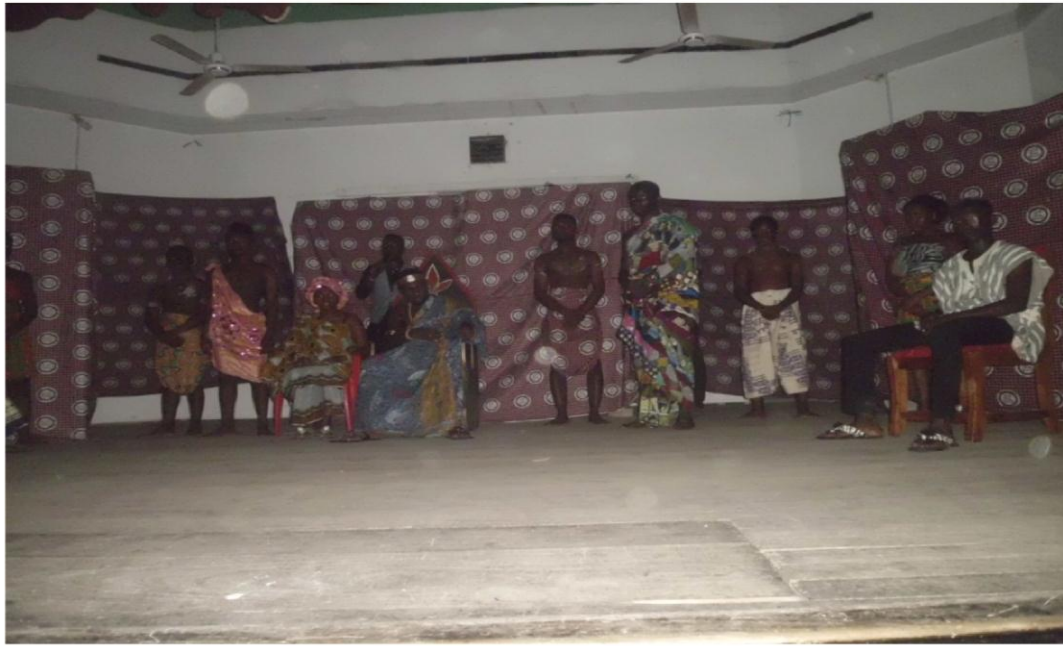
A drama group from School of performing Arts, University of Ghana