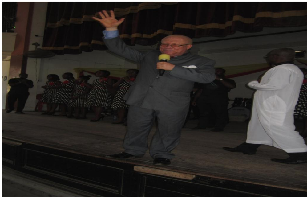
Hope and Opportunities in People.