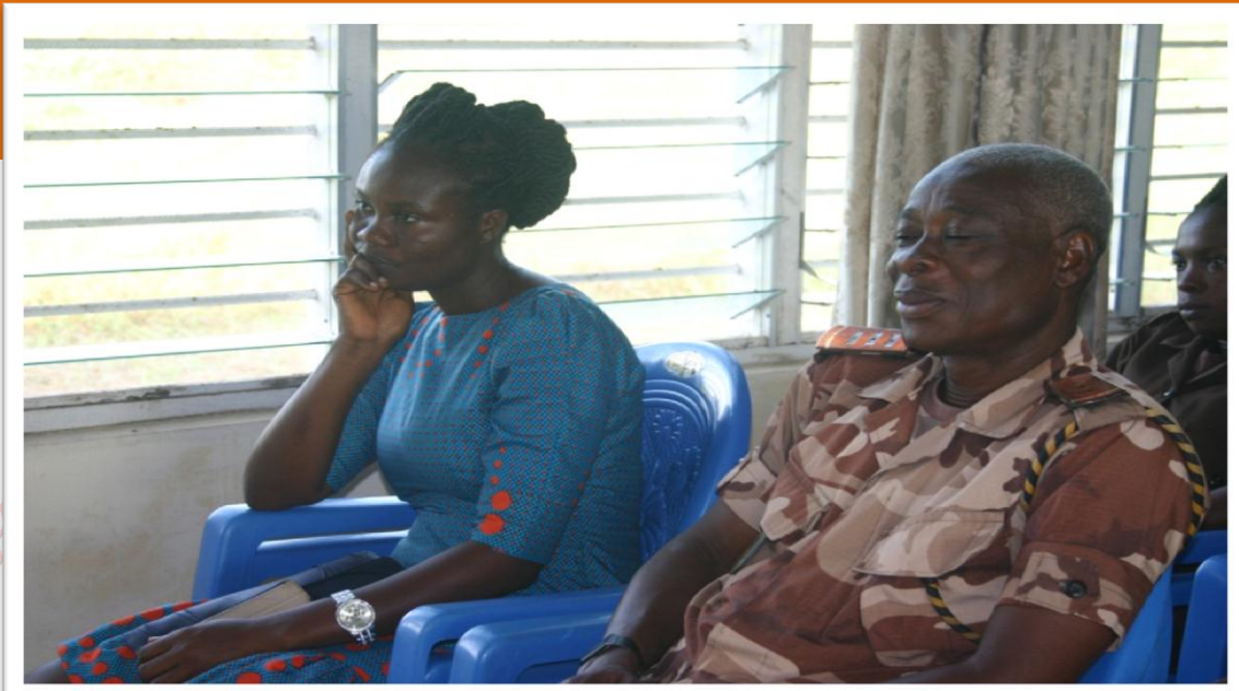
A CCCN psychiatric team member siding by an officer