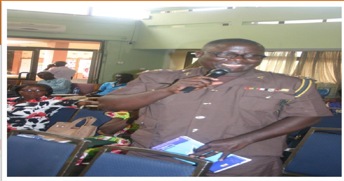
A Prison officer asking questions