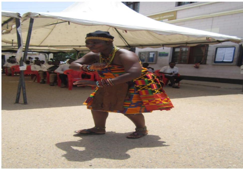
A cultural troop dancer at the climax of a month schools outreach program