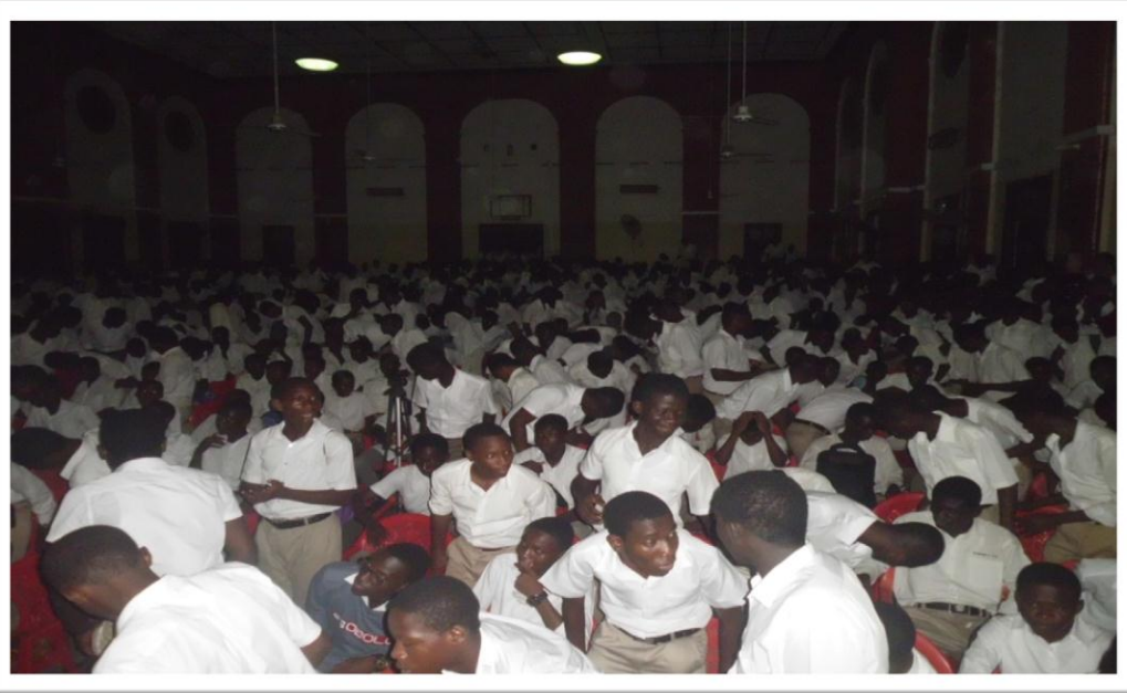
Creating Suitable Environment, Restoring One of the schools outreach events. Hope and Opportunities in People.