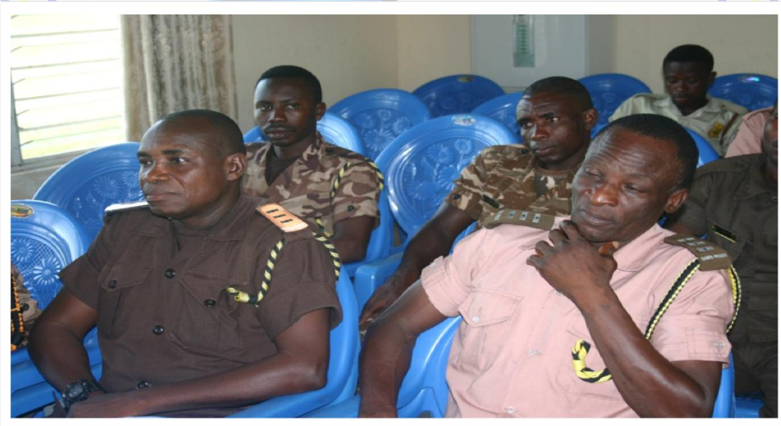
Some participation officers