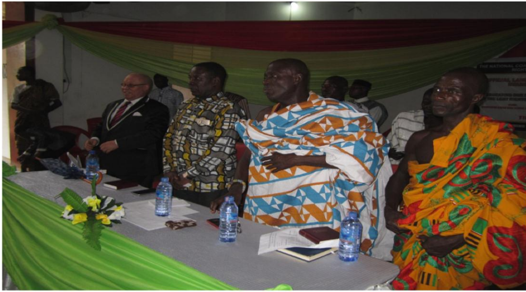
Traditional Rulers at one of the Schools Outreach events