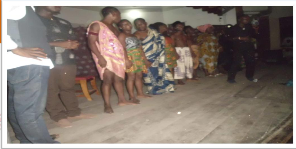
A drama group from School of performing Arts, University of Ghana performed in the Schools Outreach Program