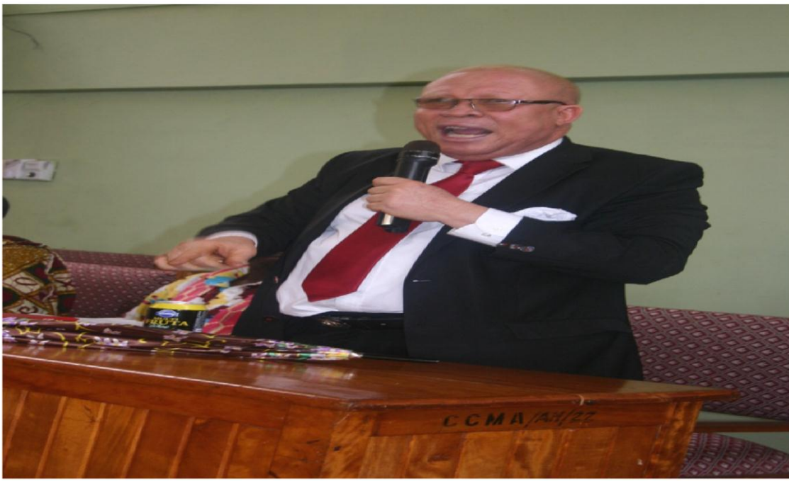
Creating Suitable Environment, Restoring Hope and Opportunities in People.