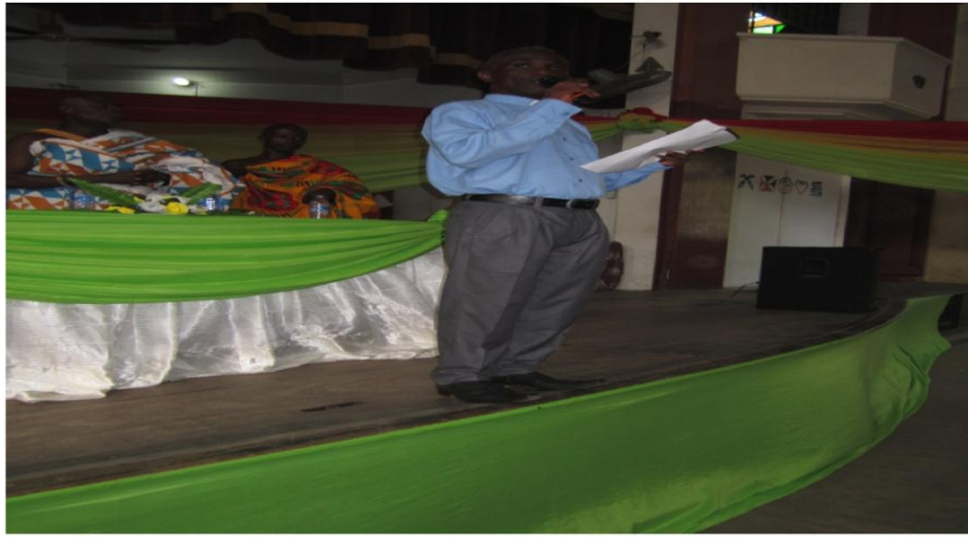
One of the Schools Outreach events