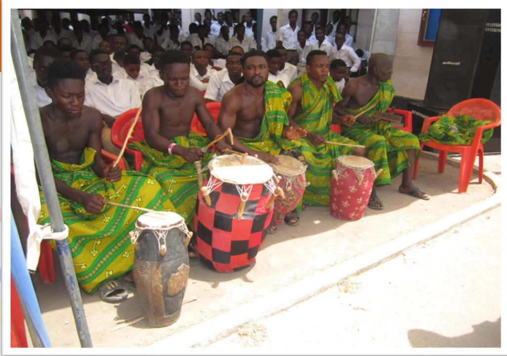
Drummers of Cultural Troops at the climax of Schools Outreach