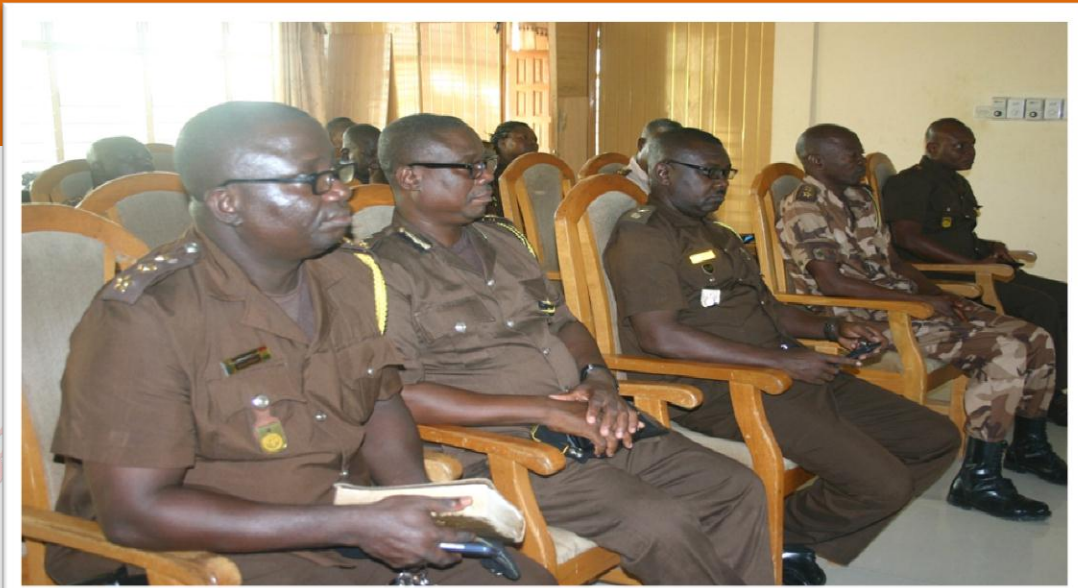
Some Senior Officers at the workshop for Prisons