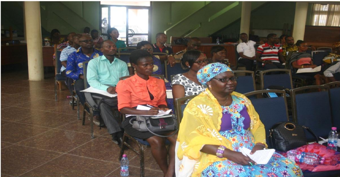
Creating Suitable Environment, Restoring Participants Hope and Opportunities in People.