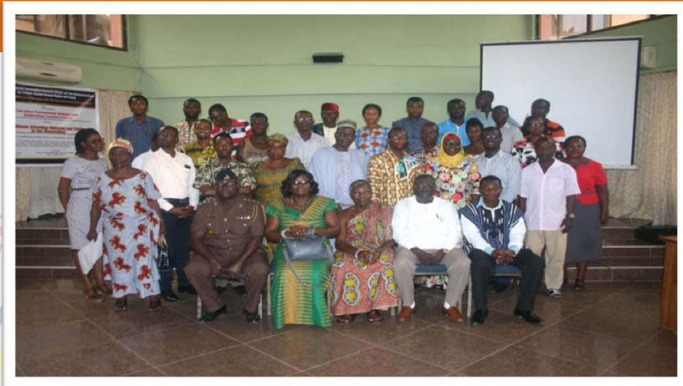
Group photo after workshop for guidance and counselors in institutions