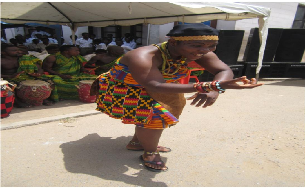
A cultural troop dancer at the climax of a month schools outreach program