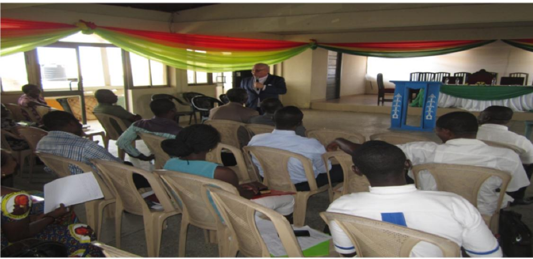
Hope and Opportunities in People.