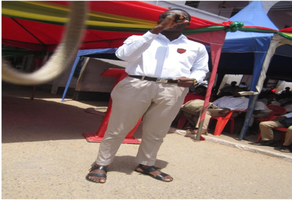
A prefect contribution