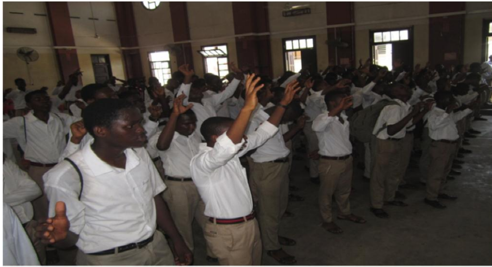
Prayer service Christians