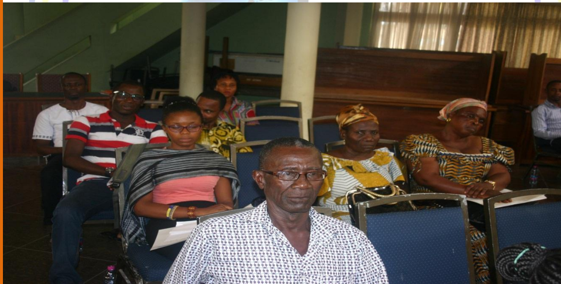
Some Participants Creating Suitable Environment, Restoring Hope and Opportunities in People.