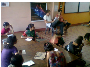
Dictation with Americans