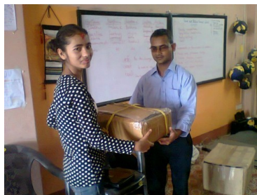
Receivign books for our library