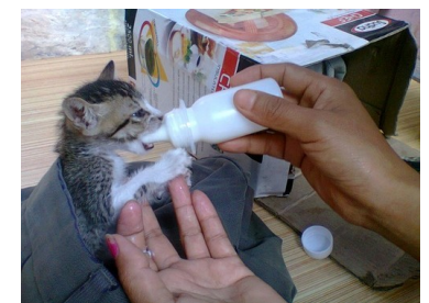
Rescuing an orphan kitty