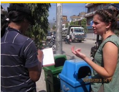
Waste management survey