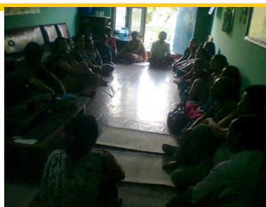
Special parents meeting