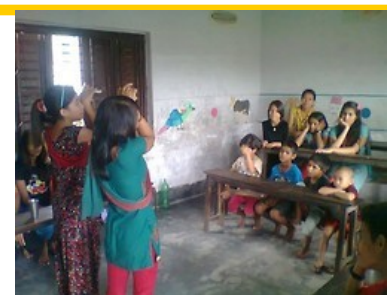
EduVision at new school