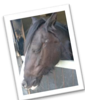
Annie - Therapy Pony