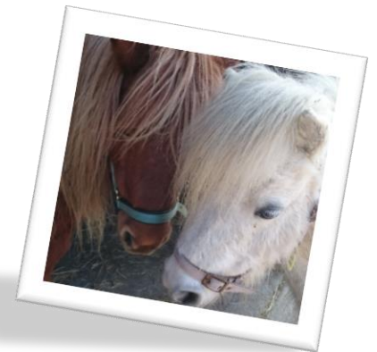
Trixie & Flora Therapy Ponies