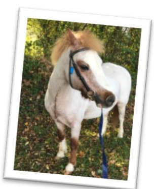
Mr Fuzz - Therapy Pony