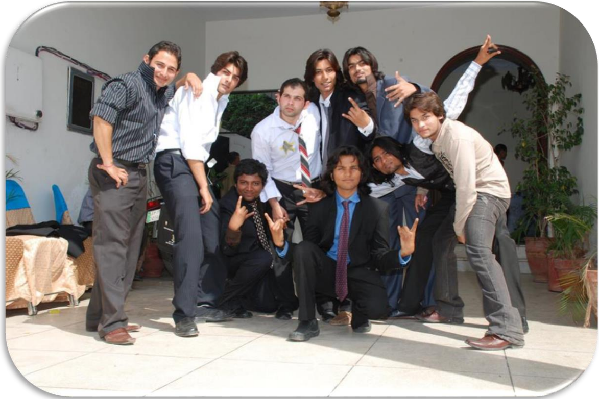
Teens enjoying after a counseling session