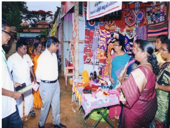
Additional Collector, Calicut at our stall