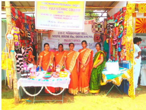
A View on Stall

R.K.Trust is providing various skill and self-employment trainings to women and young girls on soft toy making, knitting, home decorative items, Jewellery making and Aari embroidery and exhibited their products in the stall during summer festival eve. District Collector and various department officials, crime branch officials, other organization officials visited our stall and appreciated the work done by the women.