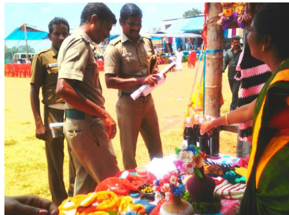
Forest department officials visited the stall